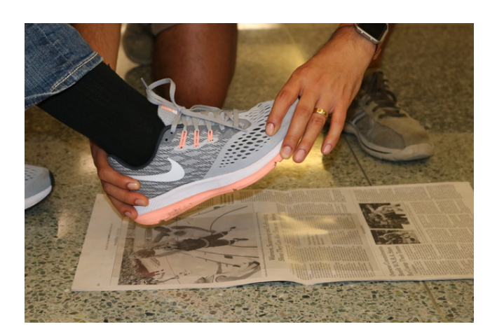
Figure 5: First have the heel make contact.

10. The researcher will then place one hand on the front portion of the shoe and use the other to hold the back corners of the film. Carefully, have the subject step off of the film while the hand on the front of the shoe is still keeping light pressure. Peel the foot forward until only the tip of the toe is