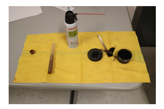
Figure 1: Supplies needed for dusting prints

3. Have the subject sit on the chair, remove a shoe, and loosen the laces. 4. Over a trash can, tap the shoe lightly to remove any loose dirt or grass. Some pebbles/dirt that is lodged in the tred is OK and could be a distinguishing characteristic. Under the fume hood and over the plastic container, brush the shoe with print powder. Dip the tip of the brush in the powder and tap the excess off on the side. Carefully, coat the entire shoe out sole in the powder being sure to include all indents, gashes, and grooves (Figure 2).