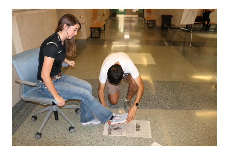
Figure 4: Guiding the Subjects shoe down to the film.

9. Guide the subjects shoe down onto the film. The subject should place their heel on the film with their toe pointing towards the ceiling. They will then roll their foot into a flat standing position and step up so that all of their weight is on the film (Figures 4-5).