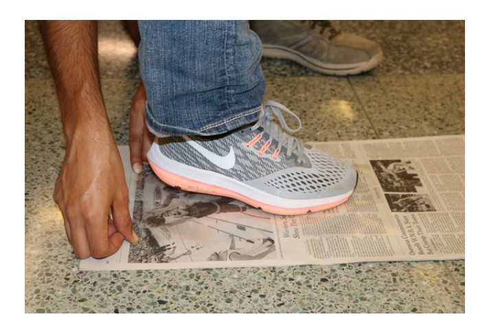
Figure 6: Have the subject step off of the scanner.

making contact with the adhesive (Figure 6). At this point, step straight off, but do not place the powdered shoe on the ground.