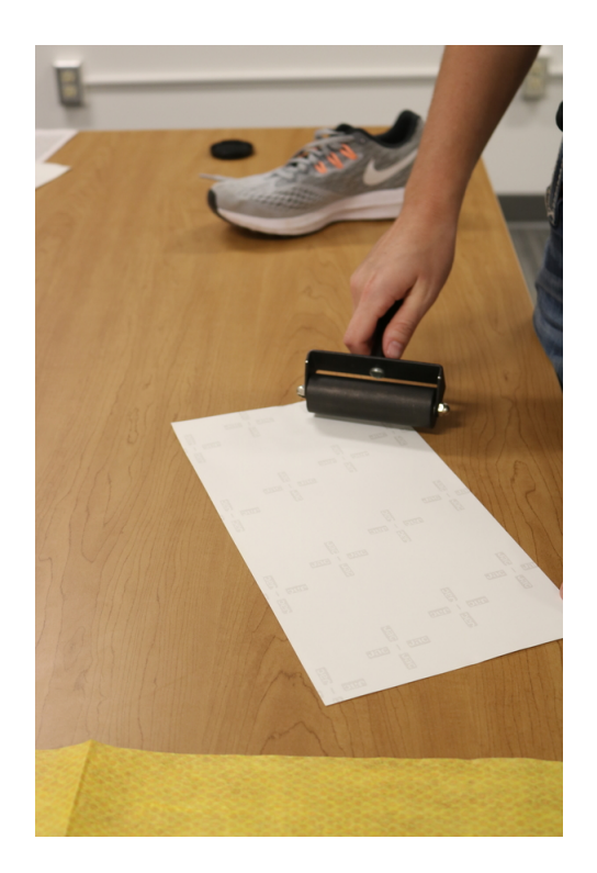
Figure 8: Carefully roll the back of the print to eliminate air bubbles.