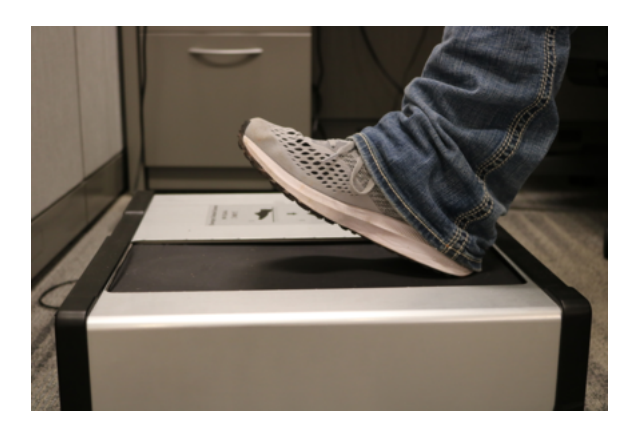
Figure 3: Technician Stepping up onto the scanner

6. When stepping up onto the scanner, the they should place their heel on the scanner with their toe pointing towards the ceiling (Figure 3). They will then roll their foot into a flat standing position and step up so that all of their weight is on the scanner (Figure 4).