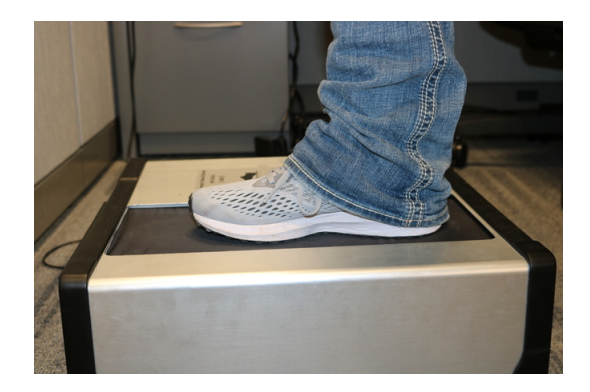
Figure 4: Technician placing their foot flat on the scanner

7. Shift weight in the shoe in order to capture all detail possible. Make sure that the shoe is not double printed.