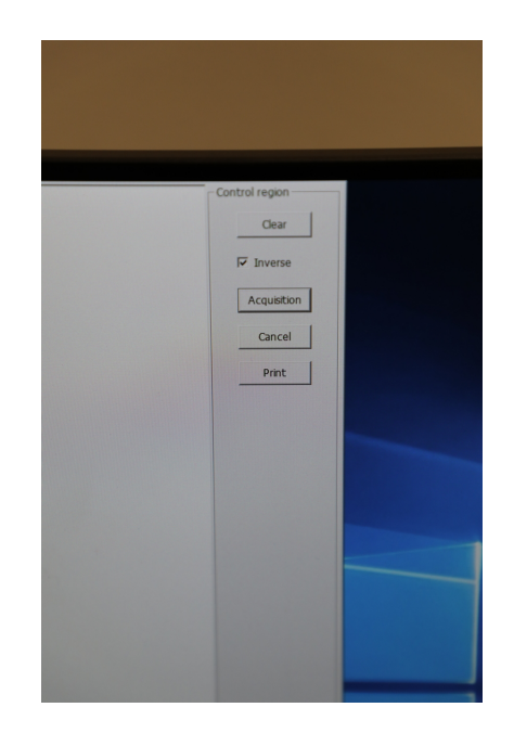
Figure 6: Close up view of the acquisition screen

10. Save the image (Figure 7) as a tiff file. Use the tool created by IT to generate a name for the image using the key on the backside of the cover of this manual. Repeat this procedure for the "detailed image" twice for each shoe.