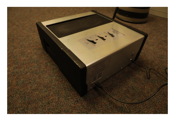
Figure 1: Everspry Shoe Scanner

The following is the recommended procedure for operating the 2D forensic shoe sole scanner (Figure 1).