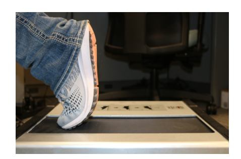
Figure 5: Technician stepping off of the scanner

8. Carefully, have the technician step off of the scanner. Peel the foot forward until only the tip of the toe is making contact with the platform. At this point, lift the foot straight up, off of the scanner (Figure 5).